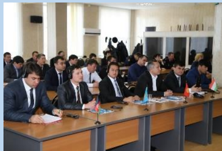
Counter Narcotics training in Domodedovo

The Trilateral project was initiated in 2012 with the financial contribution and technical expertise of Japan and in-kind contribution of Russia. The early stages of the project included only Afghanistan, and the project expanded its geographical coverage in 2016, to include the five Central Asian countries: Kazakhstan, Kyrgyz Republic, Tajikistan, Turkmenistan and Uzbekistan, with the objective of, inter-alia , the strengthening regional cooperation.