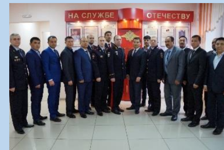
Counter narcotics training in the Siberian Law Institute, Krasnoyarsk

The Bilateral project started in 2016 with the financial and substantial technical support of Russia. Throughout Phase I and II, 174 officials were trained: 26 from Afghanistan, 5 from Pakistan and 143 from the five Central Asian Countries at the Domodedovo Training Centre and Siberian Law Institute.