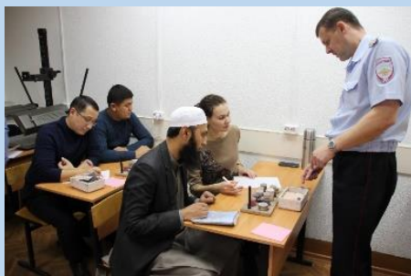
Counter Narcotics training in Siberian Law Institute, Krasnoyarsk