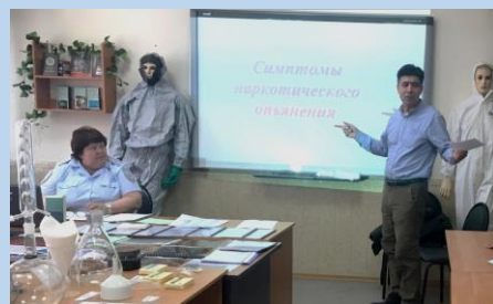
Counter Narcotics training in Domodedovo, Moscow