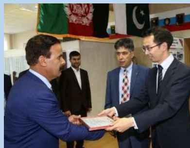
Handover of the certificates to an Afghan trainee by Japanese official

The project reached its Phase IV in 2016, with nine training courses conducted at the Domodedovo Training Centre, involving 147 counter narcotics officers from Afghanistan and Central Asia.